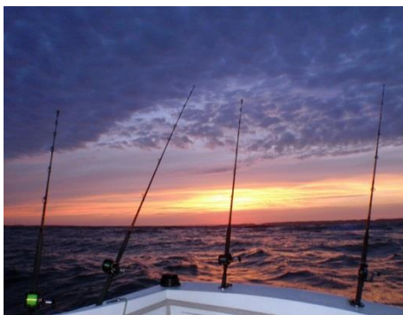
One of the reasons we fish!