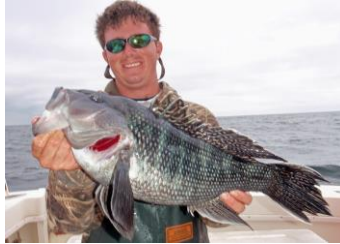
Fishin' for Sea Bass