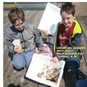
Enjoying a beautiful day on the Ft. Monroe Pier.