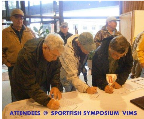
ATTENDEES @ SPORTFISH SYMPOSIUM VIMS