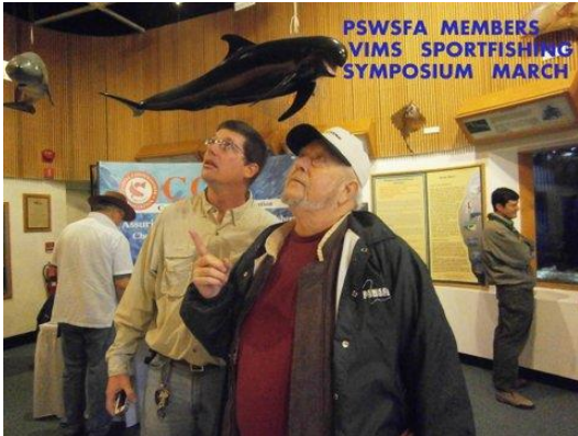
PSWSFA MEMBERS VIMS SPORTFISHING SYMPOSIUM MARCH