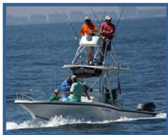
23' Dusky Center Console Skiff