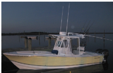
2005 Regulator 26FS w/Twin Yamaha 250's

Attention Charter Captains: If you are a paid dues member of the club and would like to list your charter service with the Chumline, please send us the information to bayrunner@cox.net .