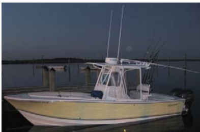
2005 Regulator 26FS w/Twin Yamaha 250's GET ANET

Attention Charter Captains: If you are a paid dues member of the club and would like to list your charter service with the Chumline, please send us the information to bayrunner@cox.net .