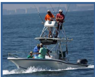
23' Dusky Center Console Skiff